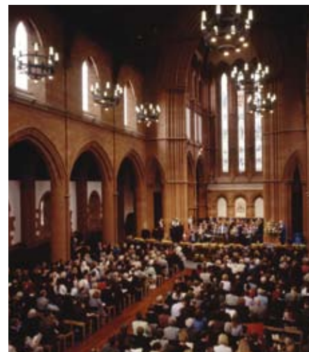
- Graduation Ceremony at the Barony Hall

Fellowship status ( F.S.S.P. ) is awarded after two years membership of the SSP.